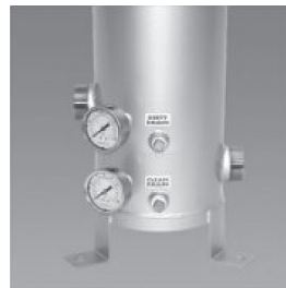
Gauge port assembly